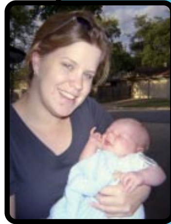
One of the many success stories at Sarah's House Maternity Home.